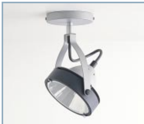
SL-100 / C