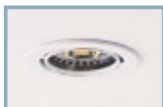
SL-50 / R / Fixed