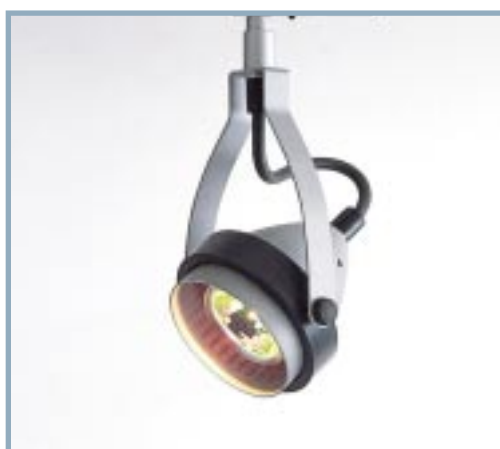
SL-50 / Tracktrans

The SL-100 with built-in reflector uses an inexpensive capsule halogen lamp. Track or ceiling mounted with a integral transformer option.