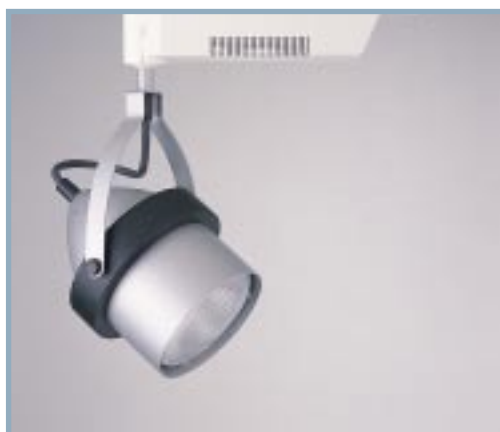
SL-30 / hal / T