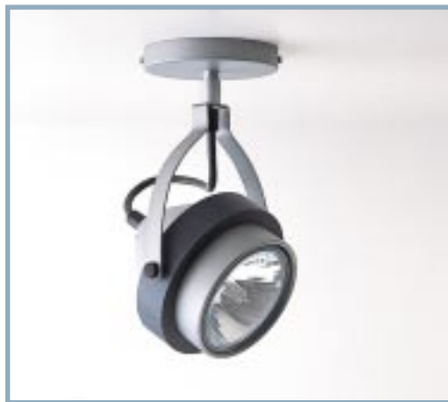
SL-30 / C