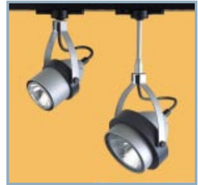
SL-30 / T / P