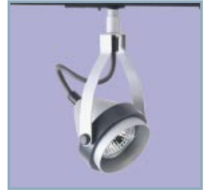
Hi-search / 50 / T / Hi-Spot 50