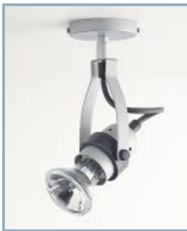
Hi Search / 40/ B / ES63