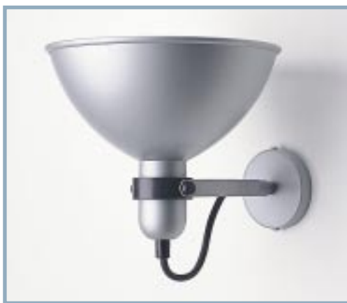
SL-210 / Wall