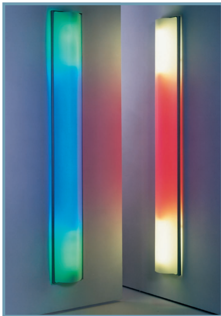
icon long 1884 x 200mm