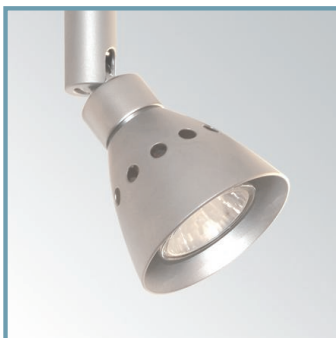
AL-02/M2/ Ø35mm halogen lamp - satin chrome

For full fixing details see FIXINGS sheet.