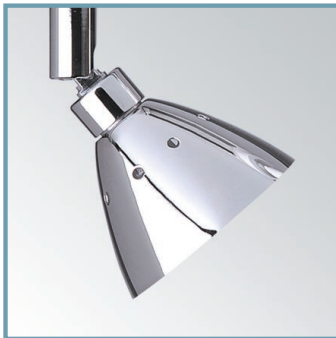
AL-02/Y/ polished chrome