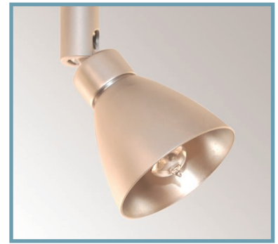
AL-02/M1/ Ø16mm front axial halogen lamp - satin nickel

AL-02/M2 Ø 35mm dichroic or reflector halogen lamp: 20W 35W