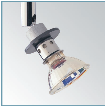
AL-02 polished chrome

The AL - 02 is fully adjustable with 90° tilt and 360° rotation. All fixing options may be combined with pendants of any length.