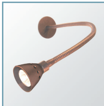
AL-05/F2/M2/500mm - bronze