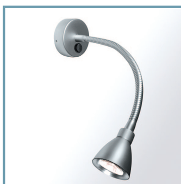
AL-05/SW/M1/Y/300mm - satin chrome