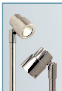
show/LED-eye - polished chrome

Show/LED-Eye is a compact 29mm diameter spotlight offering a focused beam for proximate display and task applications. 3 beam options – 26°, 34° and 54° with a range of white colour temperatures from warm white to daylight. Desk version offered with touch and press switch options.