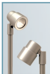
show/LED-eye - satin chrome