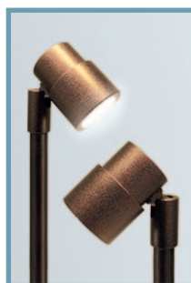
show/LED-eye - bronze